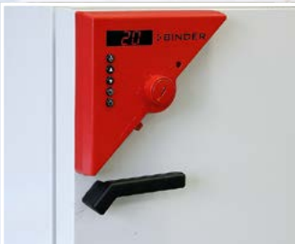
Drying ovens Binder ED 53 / Binder FD 115