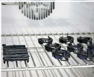
Climatic chambers Binder MKF 240 / Poleco TOP+