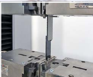
Universal testing machine Zwick Zo50 TN ProLine