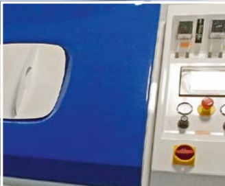
Cyclic corrosion chamber Ascott CCip 450