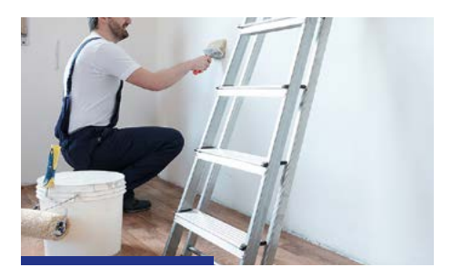
Architectural Water-based decorative coatings for interior and exterior use

With a broad portfolio of resins, binders, pigments, colorants and additives, BODO MÖLLER CHEMIE can help manufacturers meet their specific application needs like weather resistance, corrosion protection, UV protection, scratch resistance, long-term durability, emission reduction and many other properties. We focus on solutions that enhance performance, convenience and cost-effectiveness.