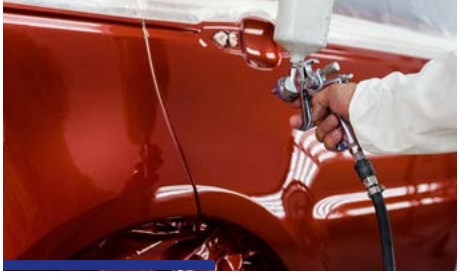
Automotive & Transportation OEM and refinish coatings for vehicles