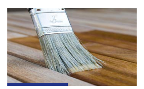
Wood Solvent- or water-based wood varnishes