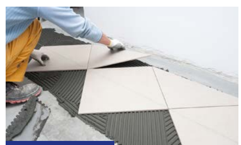
Building & Construction Protective and maintenance coatings, floor coatings, building adhesives and sealants